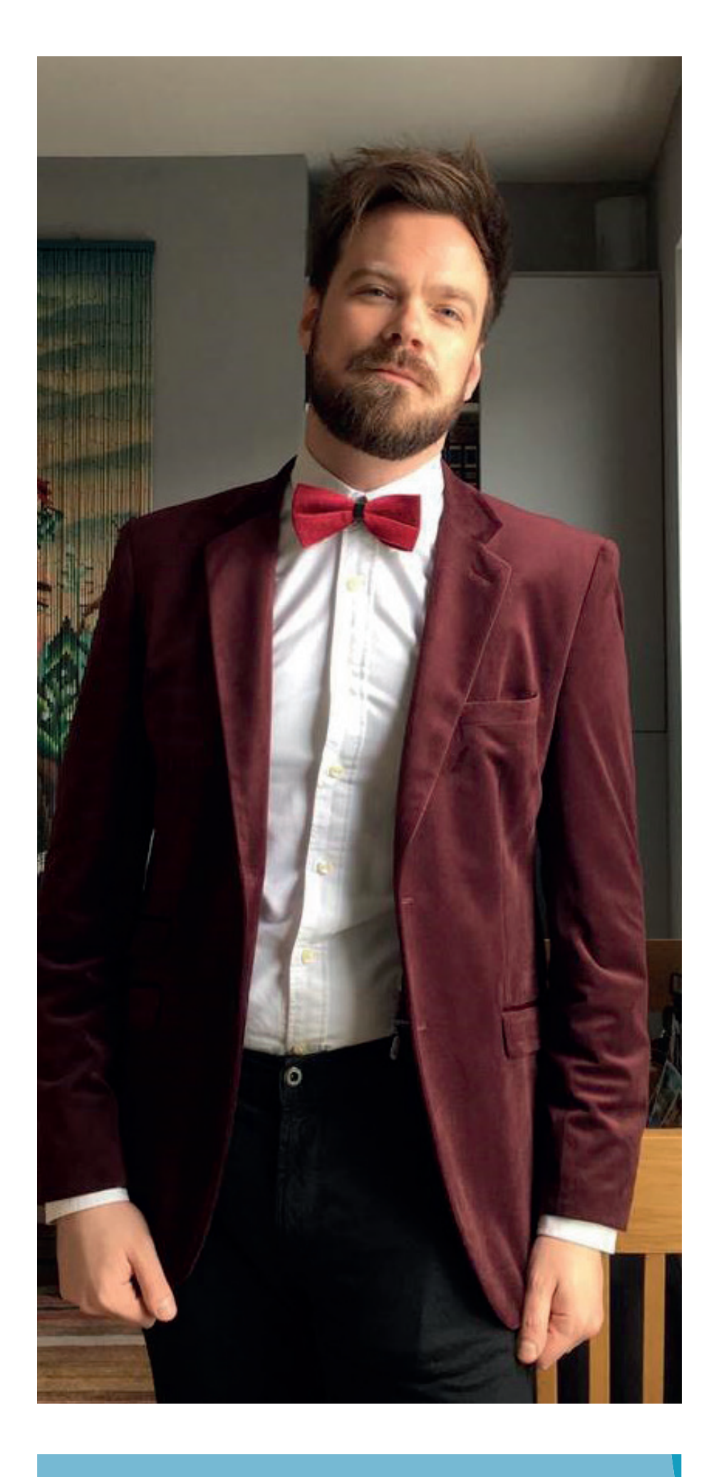
UK Disability Month is a time to celebrate the lives and stories of disabled people. Stonewall are proud to mark UK Disability History Month. These posters share the stories of disabled LGBT people in their own words.

'I'M PROUD TO BE DISABLED AS I AM PROUD TO BE LGBT+. THEY BOTH BECAME SOURCES OF POWER FOR ME AFTER I ACCEPTED WHO I AM. THAT'S THE TRUE MEANING OF PRIDE.'