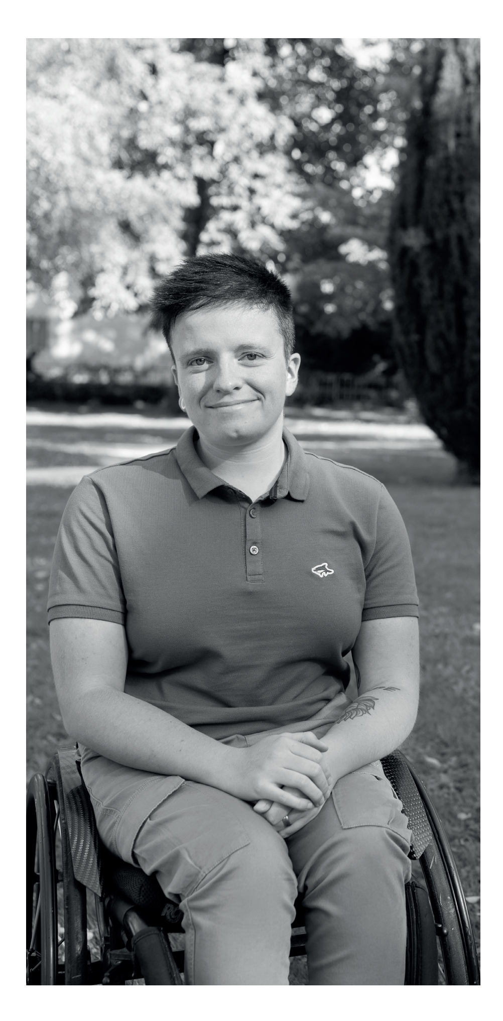
UK Disability Month is a time to celebrate the lives and stories of disabled people. Stonewall are proud to mark UK Disability History Month. These posters share the stories of disabled LGBT people in their own words.

'AS A PROUD DISABLED AND QUEER INDIVIDUAL, I AM THANKFUL TO BE PART OF COMMUNITIES THAT HAVE TAUGHT ME THAT THE POWER OF LOVE SEES ALL PEOPLE. BY SEEING THE VALUE OF EACH PERSON I ENCOUNTER FIRST RATHER THAN OUR DIFFERENCES, WE GIVE EACH OTHER FREEDOM. BUT BY EMBRACING EACH OTHERS' DIFFERENCES, WE GROW.